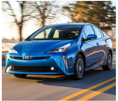
like the Toyota Prius