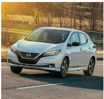
like the Nissan Leaf

"The MileageSmart program gave me the opportunity to get a newer car within my price range. This will hopefully result in more secure transportation for a longer time. It was an efficient, straight forward process. I am happy to get great gas mileage, too!"